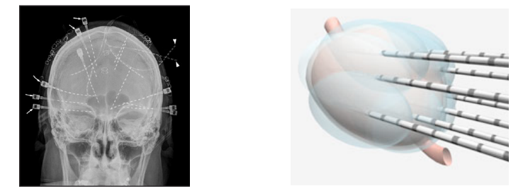
SEEG (left) and cryoablation (right)

The methods proposed during this PhD will be implemented in the planning software and will be compared to literature. Particular attention will be given to the presentation of the results in an intuitive and ergonomic way. A rigorous validation will be performed in collaboration with radiologists of the University Hospital of Strasbourg for the cryoablation application, and with neurosurgeons from the University Hospitals of Rennes, Strasbourg and Hôpital de la Pitié Salpêtrière of Paris for SEEG. The candidate will also interact with academic partners at LTSI Rennes, ICM Paris, and SPL Boston.