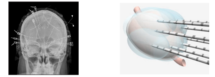
SEEG (left) and cryoablation (right)

The methods proposed during this PhD will be implemented in the planning software and will be compared to literature. Particular attention will be given to the presentation of the results in an intuitive and ergonomic way. A rigorous validation will be performed in collaboration with radiologists of the University Hospital of Strasbourg for the cryoablation application, and with neurosurgeons from the University Hospitals of Rennes, Strasbourg and Hôpital de la Pitié Salpêtrière of Paris for SEEG. The candidate will also interact with academic partners at LTSI Rennes, ICM Paris, and SPL Boston.